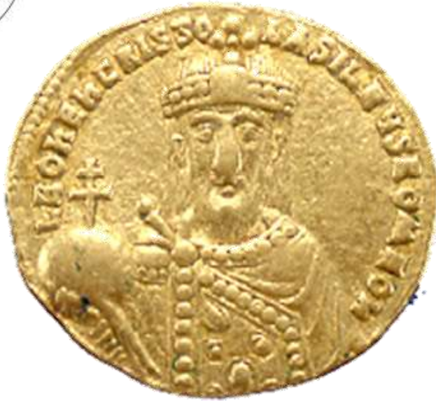
Leo VI, 886-912 AD Solidus