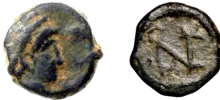
Anastasius I, pre-reform copper, 491-498 AD AE nummus, 0.93 gm. 1/7200 of AV solidus