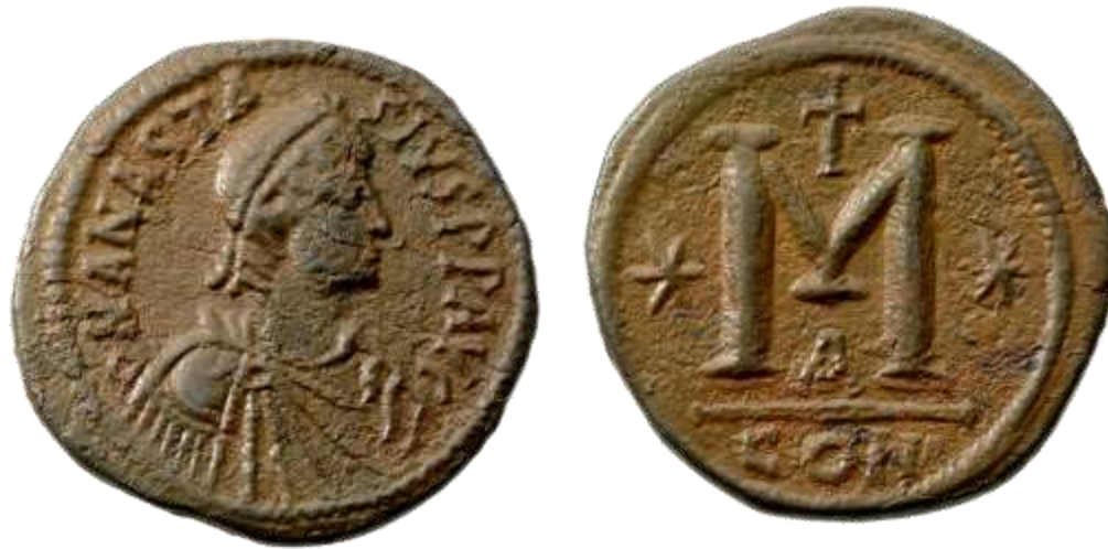
Anastasius I, post-reform AE follis. 498 AD 1/288 of AV solidus