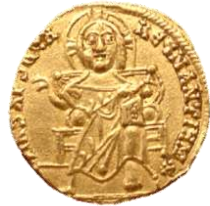
Basil I, 867-886 AD Solidus