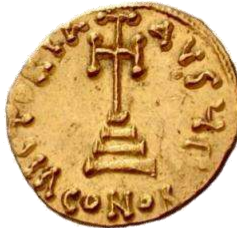
Leontius, 695-698 AD Solidus