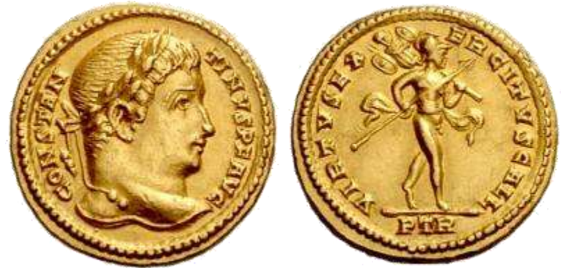
Constantine I, 307-337 AD Solidus, Treveri 312-313,