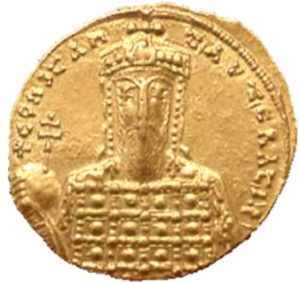
Constantine VII, 913-959 AD Solidus