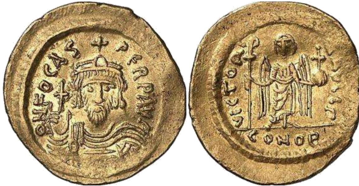
Phocas, 602-610 AD Solidus