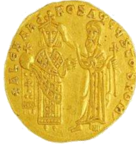
Alexander, 912-913 AD Solidus