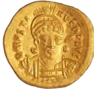
Justin I 518-527 AD