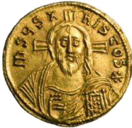
Michael III, 842-867 AD Solidus