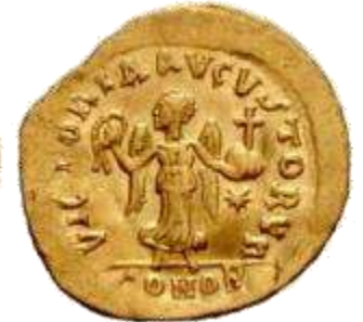
AV Tremissis, 1.50 gm.