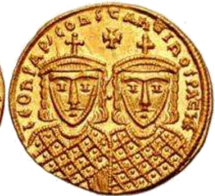
Leo III, 717-741 AD and ICONOCLASM, 726-843 AD