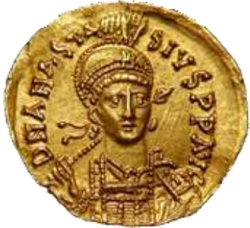
Anastasius I 491-518 AD