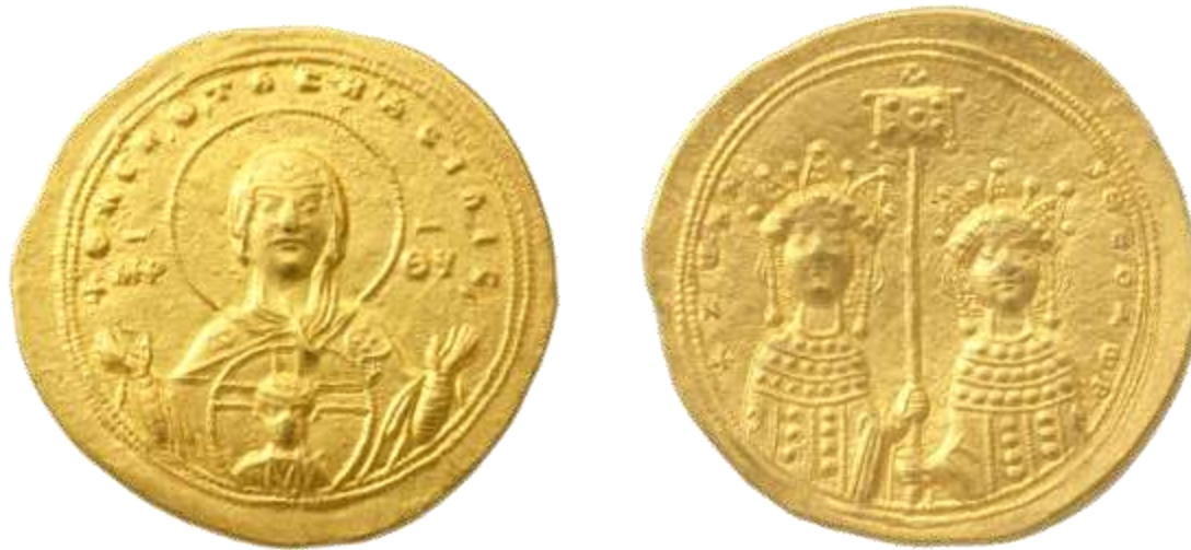
Zoe and Theodora, 1042 AD Histamenon Nomisma