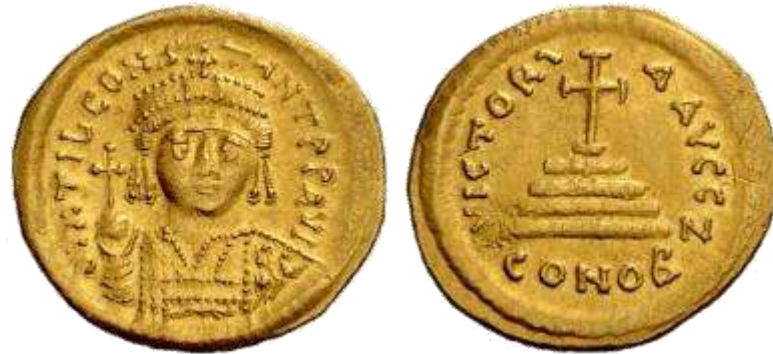
Tiberius II, 578-582 AD Solidus