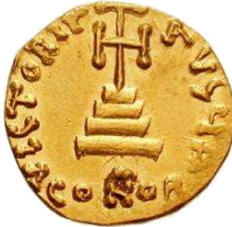
Justinian II, 687-695 AD Solidus