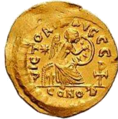
AV Semissis, 2.27 gm.