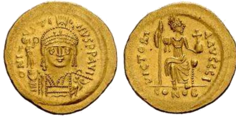
Justin II, 565-578 AD Solidus