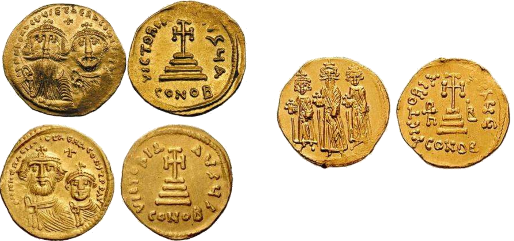
Heraclius, Heraclius Constantine, Heraclonas, 610-641 AD