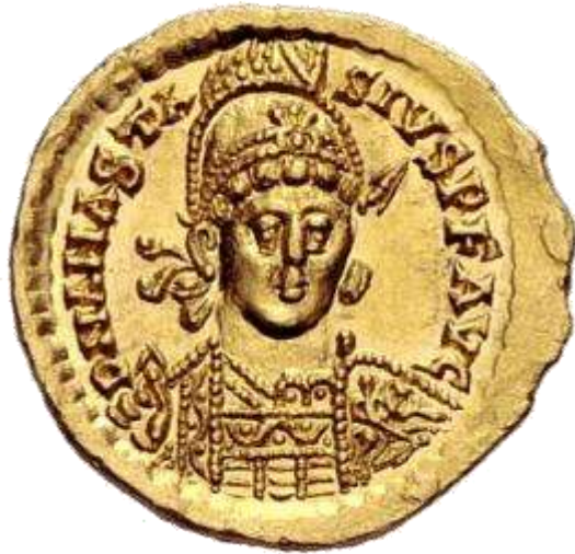
AV Solidus, 4.55 g. 24 carats, 1/72 of Roman pound