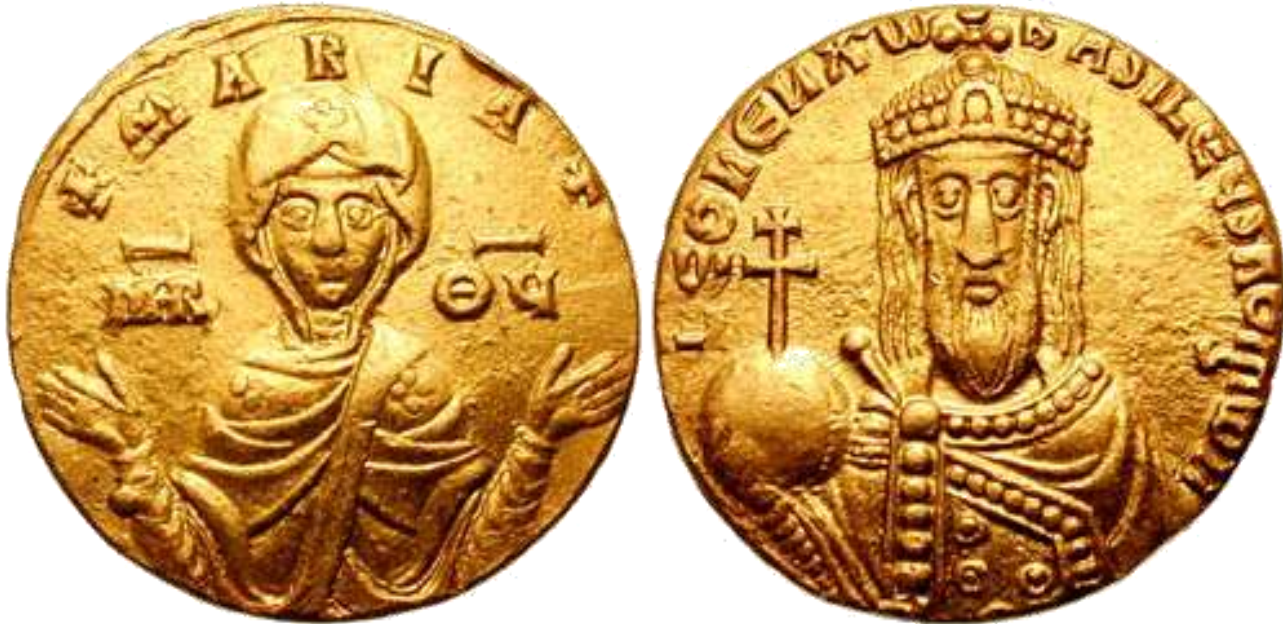
Leo VI, 886-912 AD Solidus