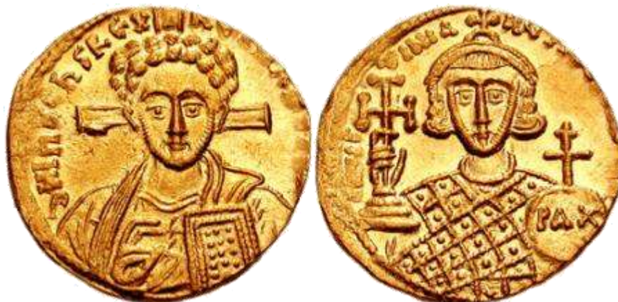
Second reign 705-711 AD