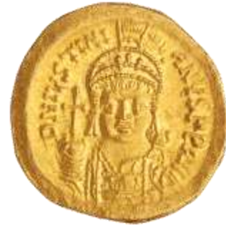
Justinian I 527-565 AD