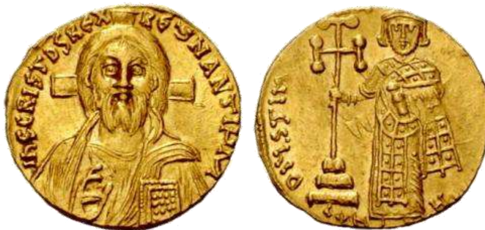
First reign 685-695 AD