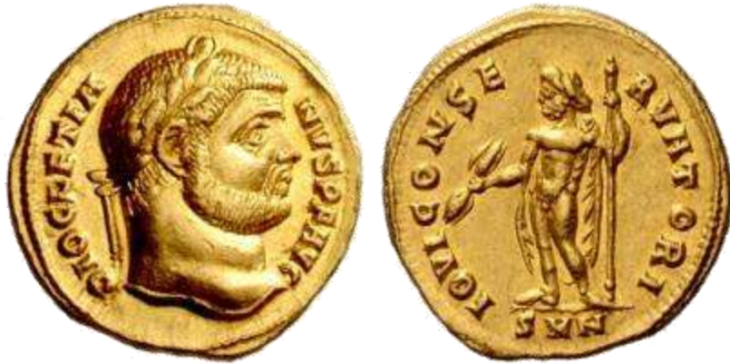
Diocletian, 284-305 AD Aureus, Nicomedia circa 294 AD