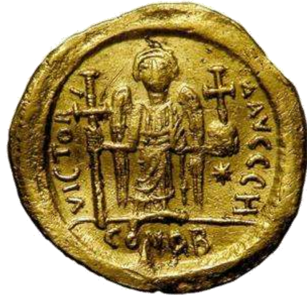
Justin I & Justinian I, 527 AD Solidus